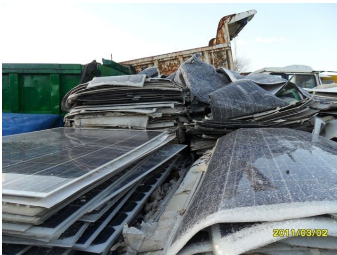
Figure 4: The mangled PV panels in this picture illustrate the nature of broken solar panels; the glass cracks but the panel is still in one piece.

PV panels constructed with the same basic components as modern panels have been installed across the globe for well over thirty years. 3 The long-term durability and performance demonstrated over these decades, as well as the results of accelerated lifetime testing, helped lead to an industry standard 25-year power production warranty for PV panels. These power warranties warrant a PV panel to produce at least 80% of their original nameplate production after 25 years of use. A recent SolarCity and DNV GL study reported that today's quality PV panels should be expected to reliably and efficiently produce power for thirty-five years. 4